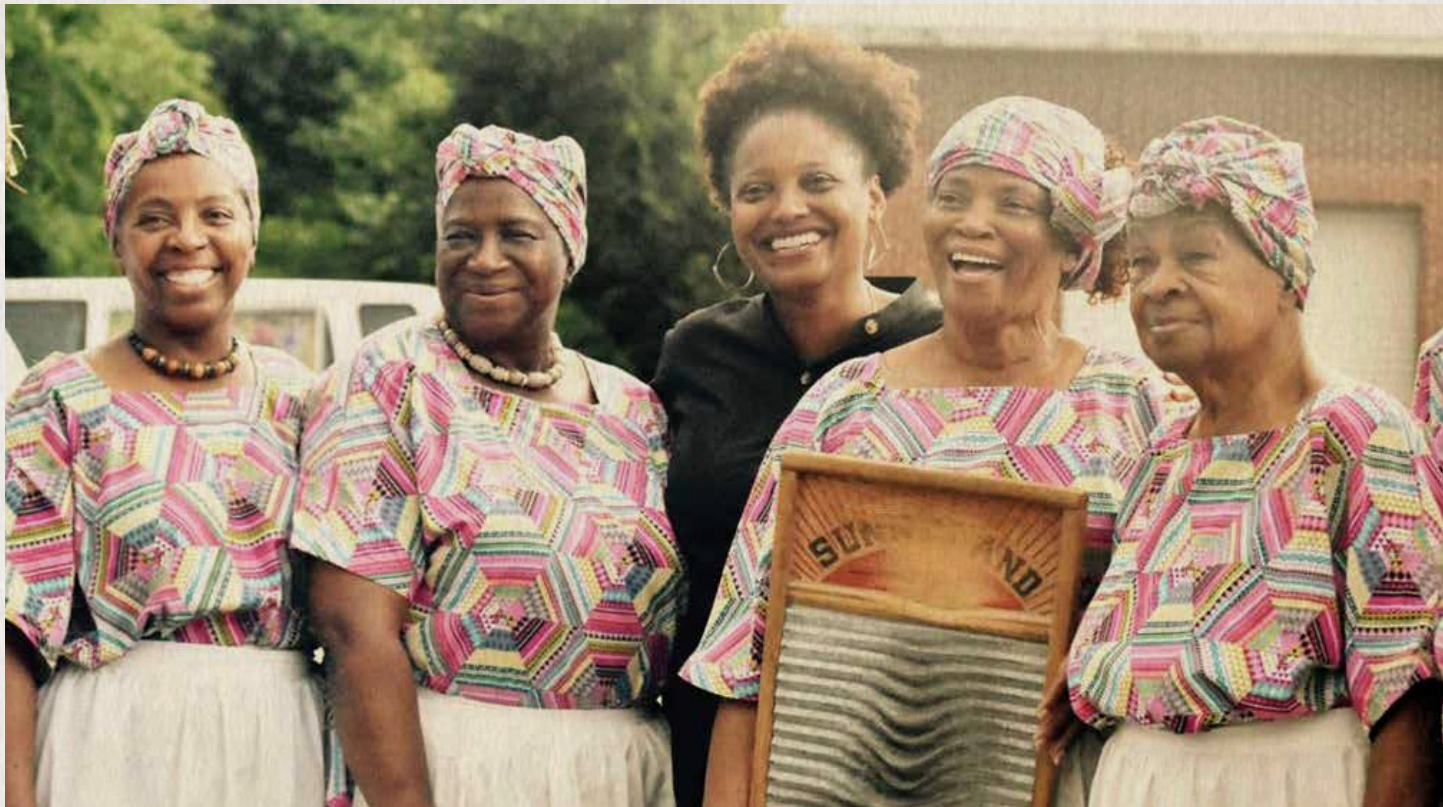
PHOTOS Clockwise from top: Geechee Gullah Ring Shouters of Darien, Georgia with U.S. Poet Laureate Tracy K. Smith in July 2018. The title poem of her new book, “Wade in the Water”, is dedicated to them / The Jenkins Praise House on St. Helena Island, South Carolina / Photograph depicting a ring shout and believed to have been taken in Georgia in the 1930’s / Grave located in the cemetery of Midway Presbyterian Church in Midway, Georgia, which is located in rural Liberty County OPPOSITE: An abandoned rice field at the Caw Caw Interpretive Center in Ravenel, South Carolina