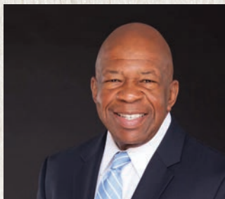
Representative Elijah Cummings

The Alliance of National Heritage Areas and all our members would not be where we are today without the steadfast support of dedicated legislators, partner organizations, and individual citizens who give voice to National Heritage Areas and the important work we do. We thank them for their longstanding support and honor them as our 2020 Heritage Champions.