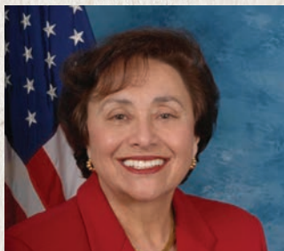
Representative Nita Lowey

Congressman Elijah Cummings (1951-2019) was an icon of the Civil Rights Movement and for the rule of law. He was a steadfast supporter of Baltimore National Heritage Area and of the National Heritage Areas program and was instrumental to Baltimore's designation as an NHA. Congressman Cummings (MD-7) believed anything was possible. His humble, but mighty, character reflected his own beginnings as a share-cropper's son who rose to become a United States Representative. He was a true advocate for young people, seniors, and communities working together to make an impact and preserve our nation's heritage.