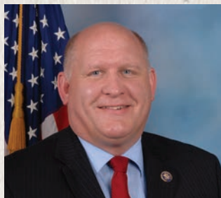
Representative Glenn "G.T." Thompson

Serving as a Representative for New York since 1989, Congresswoman Nita Lowey has enthusiastically supported not only the Hudson River Valley NHA, which is in her district (NY-17), but all four of New York's NHAs. As Ranking Member and now Chair of the House Appropriations Committee, Congresswoman Lowey has been in a unique position to help preserve funding for the National Heritage Areas program, benefiting all 55 Congressionally-designated NHAs. Her work reflects her passion for historic preservation and heritage tourism. She has championed our cause, and we thank her for her support.